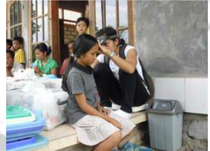
Bali Kids Foundation provided the Yayasan with free medicine and health checks for all the children.